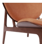
Dark Stained Oak