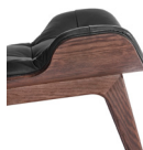
Dark Stained Oak